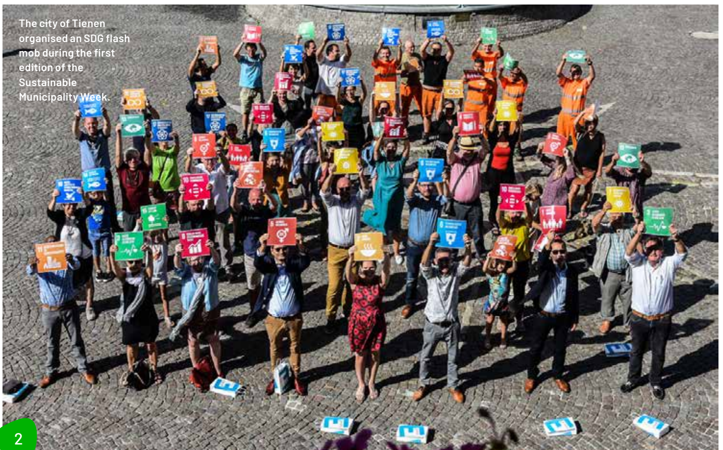
The city of Tienen organised an SDG flash mob during the first edition of the Sustainable Municipality Week.