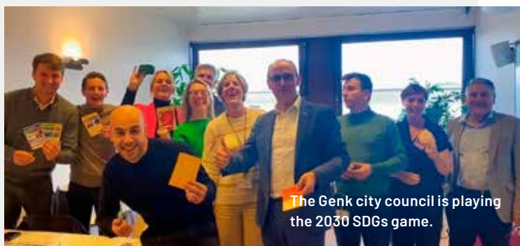
The Genk city council is playing the 2030 SDGs game.