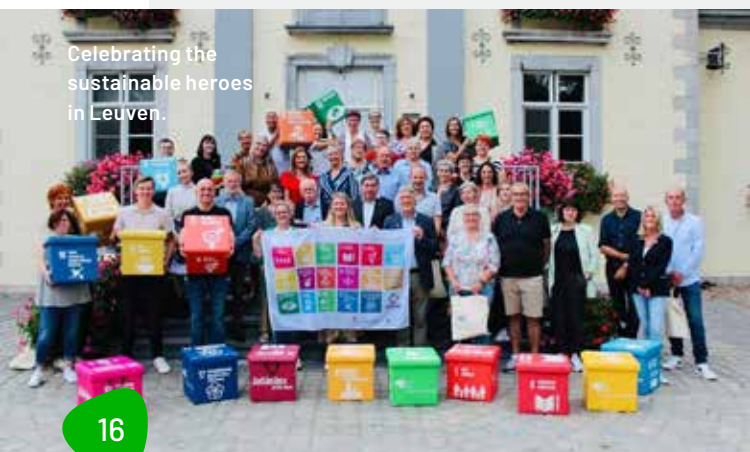
Celebrating the sustainable heroes in Leuven.

The city of Genk (>60,000) also takes advantage of Sustainable Municipality Week to communicate widely on the SDGs, both to citizens and to its own employees. In 2022, for example, they headed to the weekly local vegetable market to have visitors consider how they themselves can be a sustainable hero in their daily lives through an SDG bingo game. Every city staff member (1,300 people!) also received an SDG bingo card. Services could submit a bingo card together for a chance to win a fairtrade breakfast. The city council and management team delved even deeper into the 2030 Agenda and played the ' 2030 SDGs game ' (developed by Japan's Imacocollabo). The mayor testified that the game offered many new insights, especially around forging partnerships to achieve the SDGs locally.