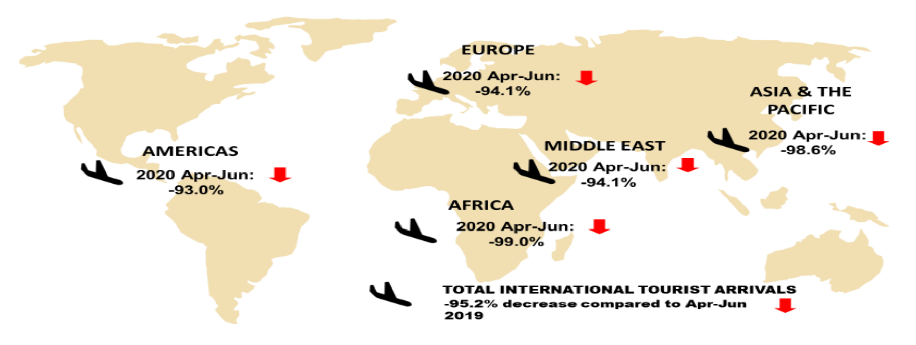
FIGURE 2: PERCENTAGE GROWTH OF GLOBAL TOURIST ARRIVALS BY REGION: APRIL-JUNE 2020 COMPARED TO APRIL-JUNE 2019