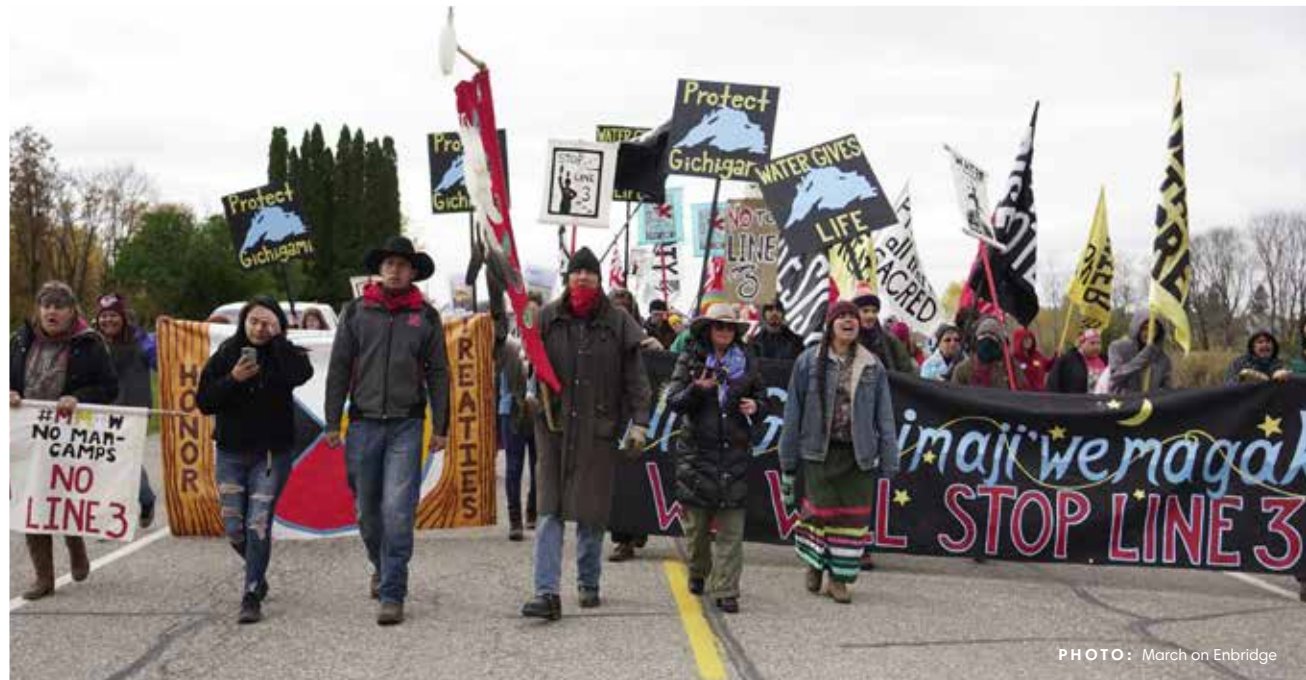
PHOTO: March on Enbridge

Enbridge is also facing ongoing legal challenges, grassroots resistance, and opposition from impacted Tribal Nations due to the health and safety, environmental, climate, and Indigenous rights risks associated with the project.