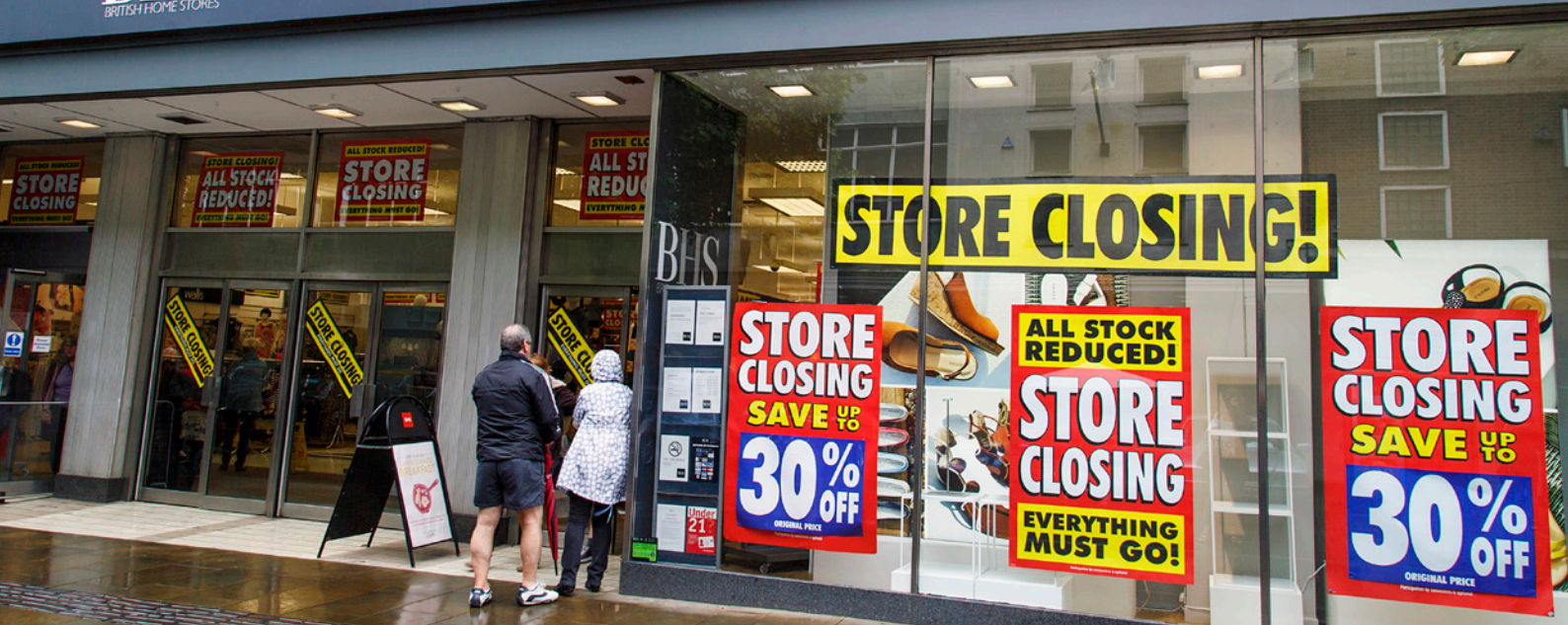
INDUSTRY ANALYSTS WARNED EARLY IN 2016 THAT 44 OF THE SURVIVING 103 DEPARTMENT STORE BUSINESSES WERE IN ACTIVE DANGER. SURE ENOUGH BHS (BRITISH HOME STORES) COLLAPSED IN A WAVE OF RECRIMINATIONS DURING THE SUMMER.

supermarkets, department stores and online-only retailers.'