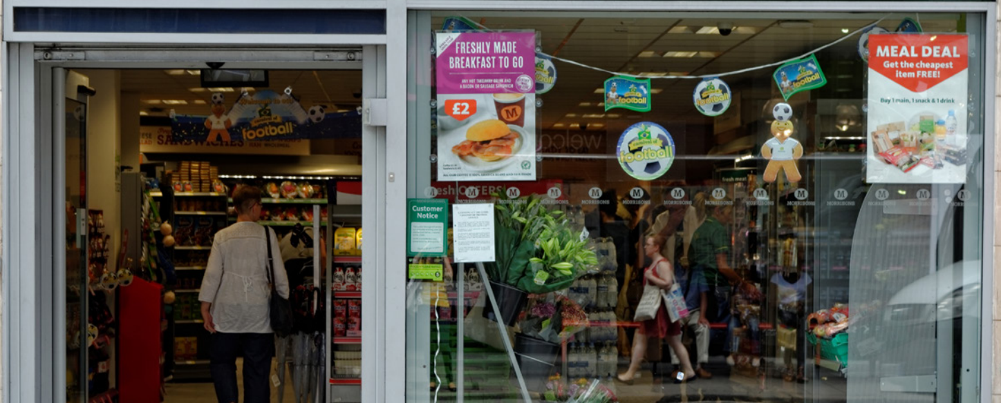
THOUGH CONVENIENCE STORES ARE ON THE RISE, MORRISONS' VENTURE INTO SMALLER FOOD STORES WAS NOT A SUCCESS, IT EVENTUALLY SOLD ON ITS M LOCAL BUSINESS IN 2015 – BUT THE RENAMED MY LOCAL BUSINESS ITSELF FAILED IN SUMMER 2016.

newspaper circulation numbers and the growth of internet shopping. [22]