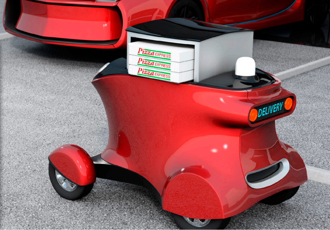
SURVIVING TOWN CENTRES WILL SEE RADICAL DIFFERENCES IN 2030: AUTONOMOUS VEHICLES ARE LIKELY TO DELIVER GOODS TO STORES FROM CITY HUBS; AND WILL ALSO BE RESPONSIBLE FOR MANY DELIVERIES DIRECTLY TO CONSUMERS.

in September 2016 to deliver its best half-year sales performance in four years. [34]