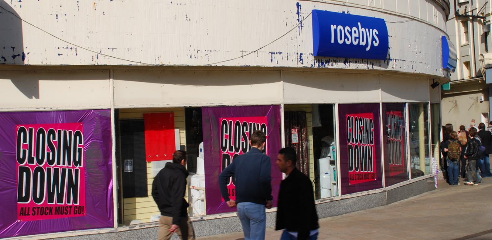
THE DOUBLE WHAMMY OF E-COMMERCE COMPETITION AND THE BANKING COLLAPSE OF 2008 SPELLED THE END FOR CHAINS SUCH AS ROSEBYS

High Street? Of course it will be greatly missed by shoppers, and many jobs depend upon it; but there is another reason why we should all be concerned for its future. Many of the pension funds we and our employers belong to invest in commercial property. A fall in the value of commercial property such as retail premises has an impact on pensions and investments. Direct investment in real estate markets by pension funds and property sovereign wealth funds was set to double over the next decade, said Jones Lang LaSalle, the property consultancy, in 2013.