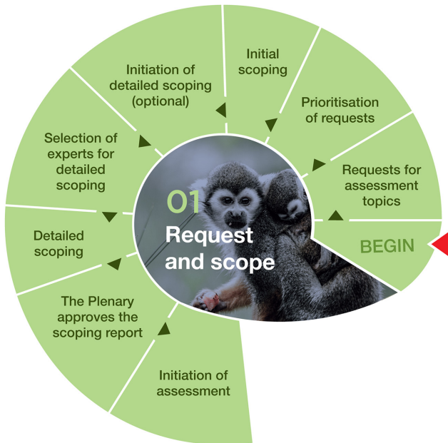
Fig. 1: The Assessment Process: Request and scope