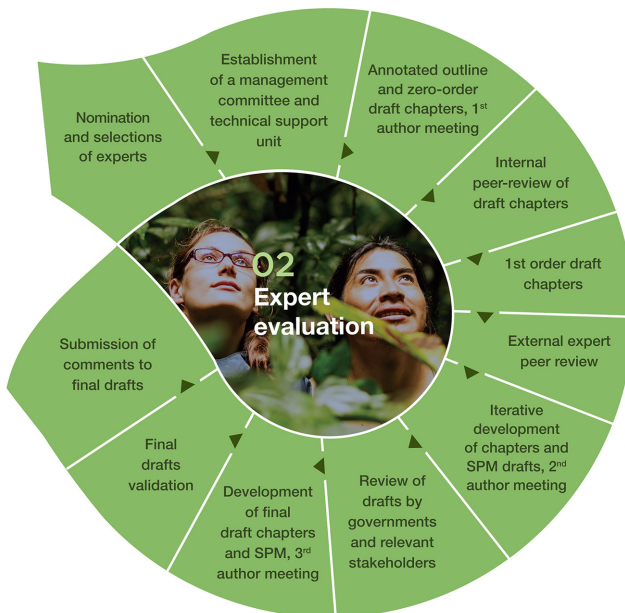
Fig. 2: The Assessment Process: Expert evaluation