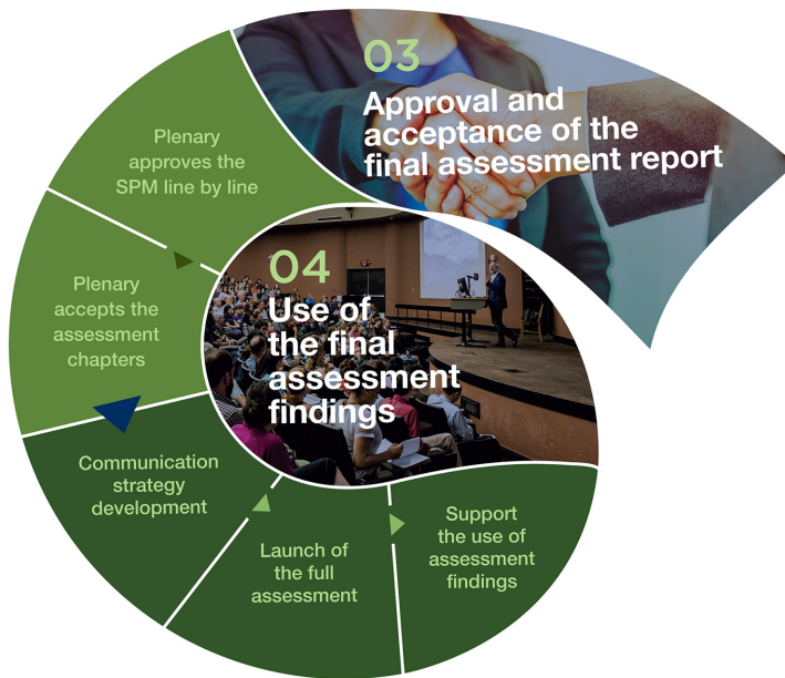
Fig. 3: The Assessment Process: Approval and acceptance of the final assessment report and Use of the final assessment findings

Figures 1–3 show the development of an assessment, including several drafts which undergo external reviews by governments and experts. Each individual who follows a registration procedure can act as a reviewer for one or more chapters of a given assessment draft and comment on the draft text. The authors team then has to answer on these comments and has e.g. to take up new evidence if provided by a reviewer.