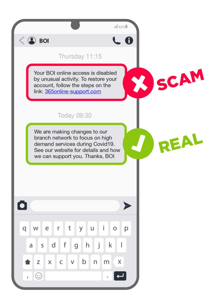
Figure 1. Example of real and scam SMS with SenderID