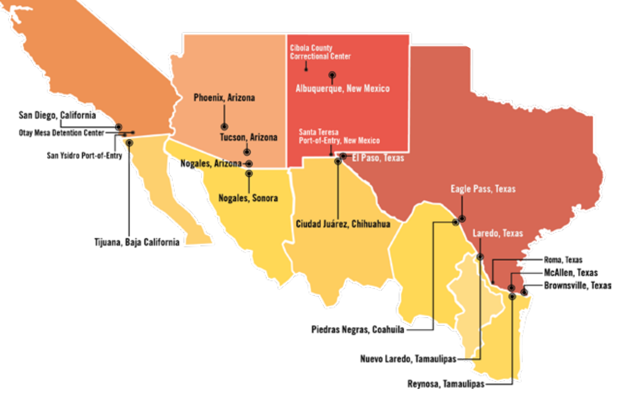
44. In a 27 June 2018 meeting with immigrant rights groups in El Paso, the Commissioner of CBP confirmed to attendees that its practice of pushbacks was being implemented border-wide, supposedly due to capacity constraints at its ports-of-entry. An attendee at the meeting told Amnesty International that the Commissioner elaborated upon the policy, noting that CBP was prescreening asylum-seekers and others without legal status to enter the United States, apparently with the aim of preventing them from reaching the US ports-of-entry where they could claim asylum. See, "BNHR and BIC meet with US CBP Commissioner on Border Crisis," available at: http://bnhr.org/bnhr.and-bic-meet-with-us-cbp-commissioner-on-border-crisis/; and KFOX14, "Local immigrant advocacy groups meet with CBP Commissioner regarding border situation" (26 June 2018): https://kfoxtv.com/news/local/local-immigrant-advocacy-groups-meet-with-cbp-commissioner-regarding-border-situation. 45. See Section 2.1 above.

By seeking to prevent asylum-seekers from entering US ports-of-entry, the US government appeared to assert an incorrect legal theory that CBP could escape its obligation to receive asylum-seekers' requests for protection, by physically restraining them on or around the border of US territory. <sup>44</sup> Even at the outermost perimeter of US territory, the turning away of asylum-seekers is a clear violation of international law. <sup>45</sup>