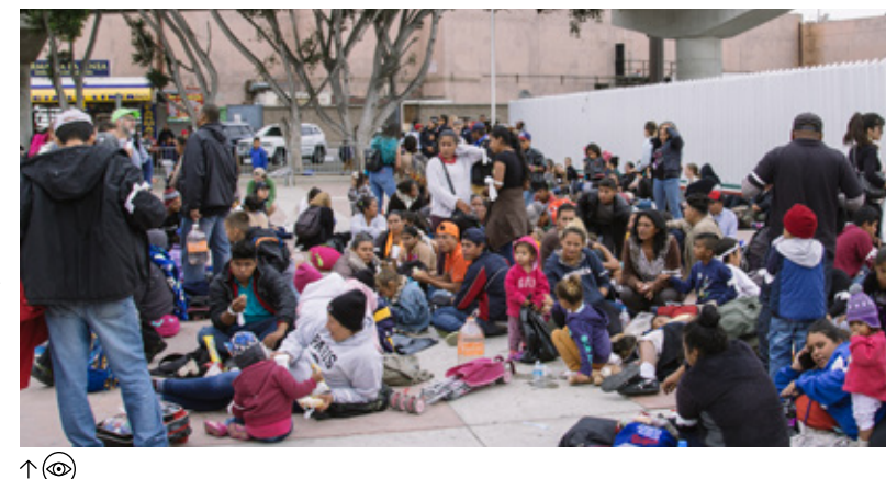
A group of mostly families waiting to request asylum, after being turned away by US authorities at the San Ysidro Port-of-Entry on 29 April 2018. Most of the asylum-seekers were families from the Northern Triangle of Central America.

As of 20 August 2018, a US immigration lawyer at the Tijuana–San Diego border reported that the wait list for asylum-seekers at El Chaparral was still over 1,000 people. Asylum-seekers who attempted to present themselves to CBP and were not on the wait list were routinely turned away – including unaccompanied minors and others with heightened vulnerability, who received no differentiation or priority.