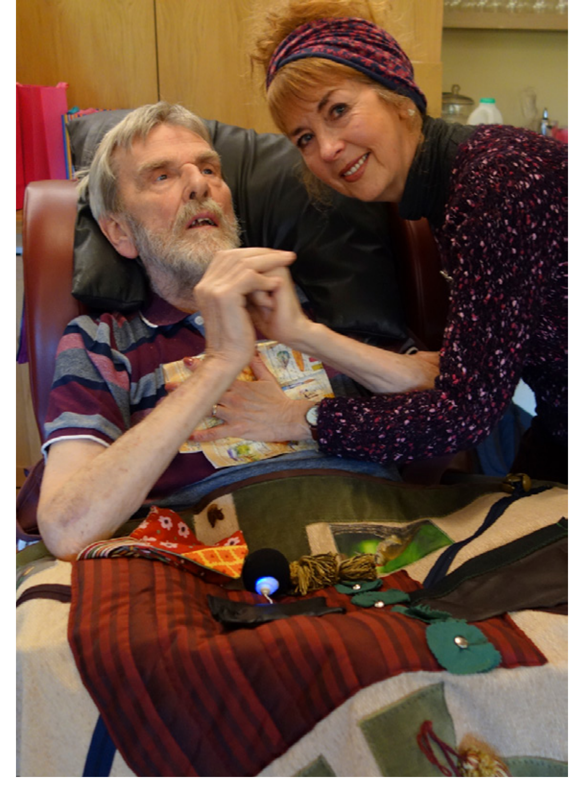
Man living with advanced dementia and his wife using a highly personalised sensory blanket with embedded electronics created as part of the CARIAD Sensor e-Textile research project.