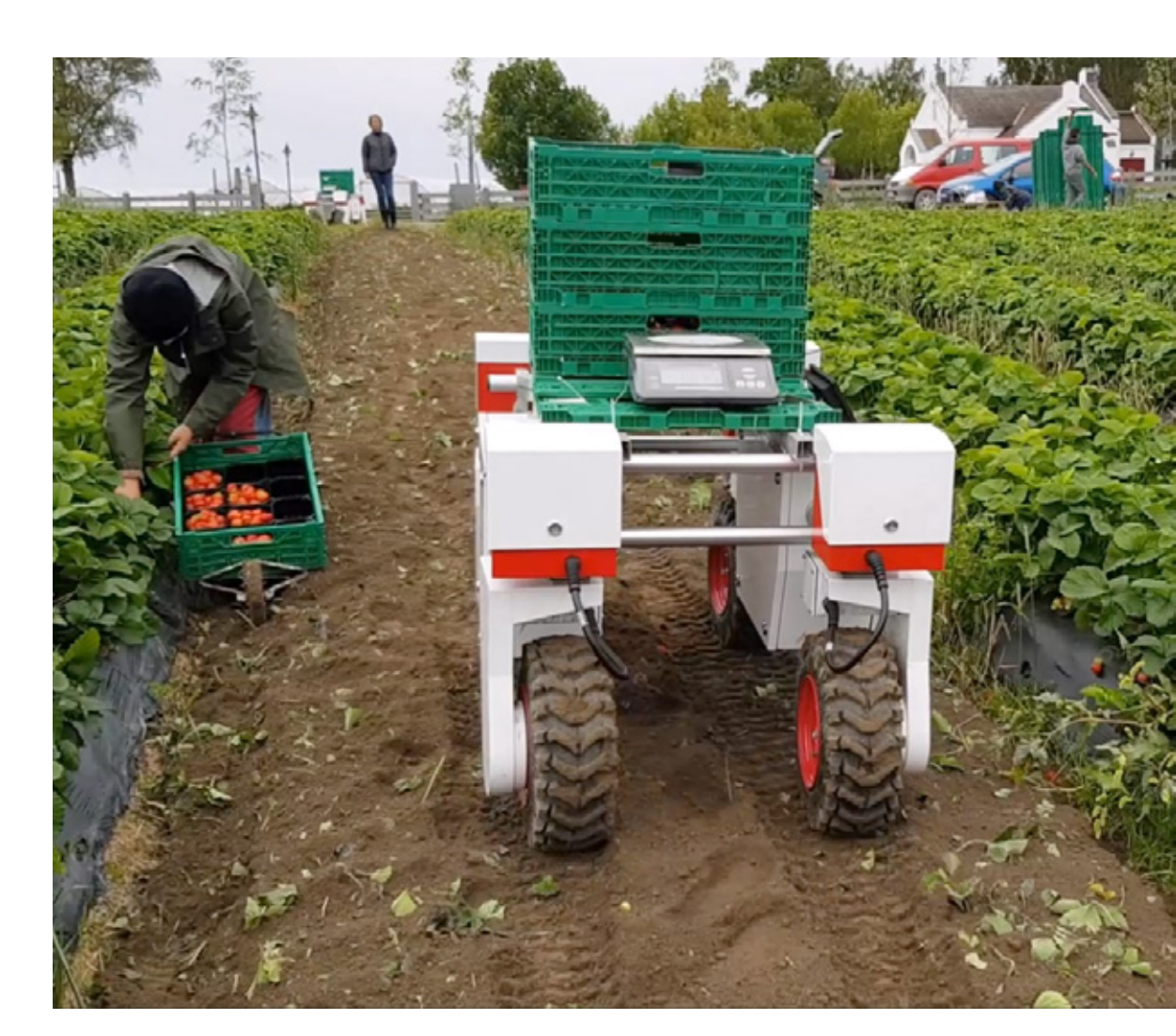
Agritech research at the University of Lincoln

The University of York used £220,000 of QR funding to create York Art History Collaborations, which connects its Department of History of Art with galleries and museums. This investment has supported partnerships with over 50 organisations - ranging from local partners such as York Art Gallery to national museums such as the National Gallery, London, Tate Britain and the V&A, and a major exhibition with the Fries Museum in the Netherlands. The department recently collaborated with the Government Art Collection on a major research project on the history of their collections and their continuing impact on international diplomacy. Partnerships have also extended the Department of History of Art's reach, with over one million people estimated to have seen co-curated exhibitions.