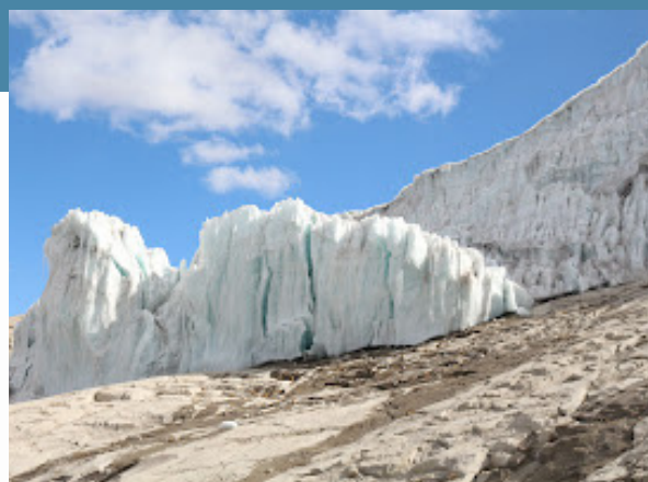
Mining concessions for the Falchani (lithium) and Macusani (uranium) projects around and on top of the Quelccaya glacier in Puno, Peru.