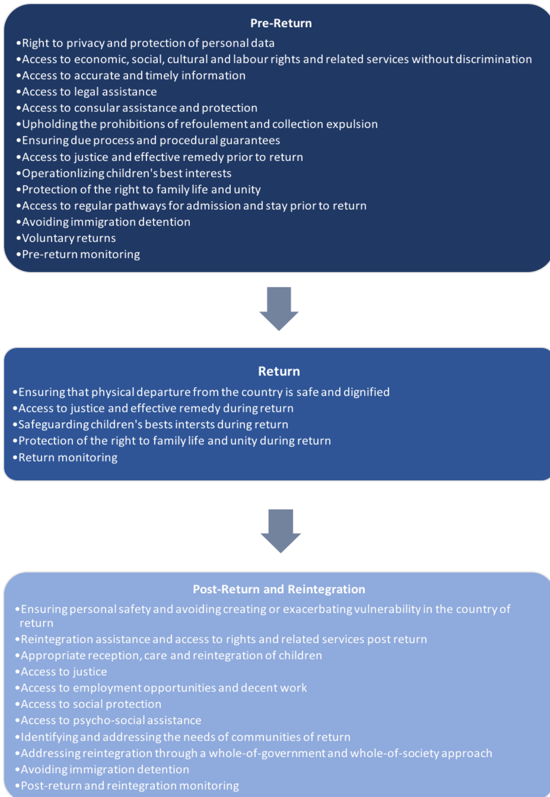
Fig. 1: Phases of return and reintegration