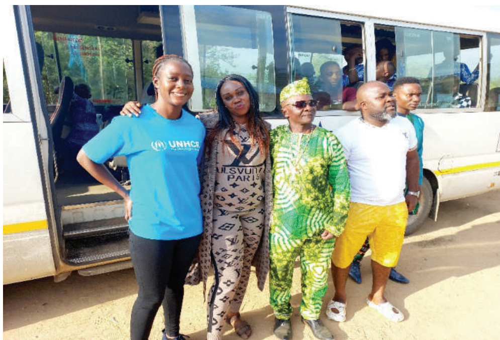
Zimbabwe, April 2023. Refugees before final departure from Tongogara Refugee Camp.