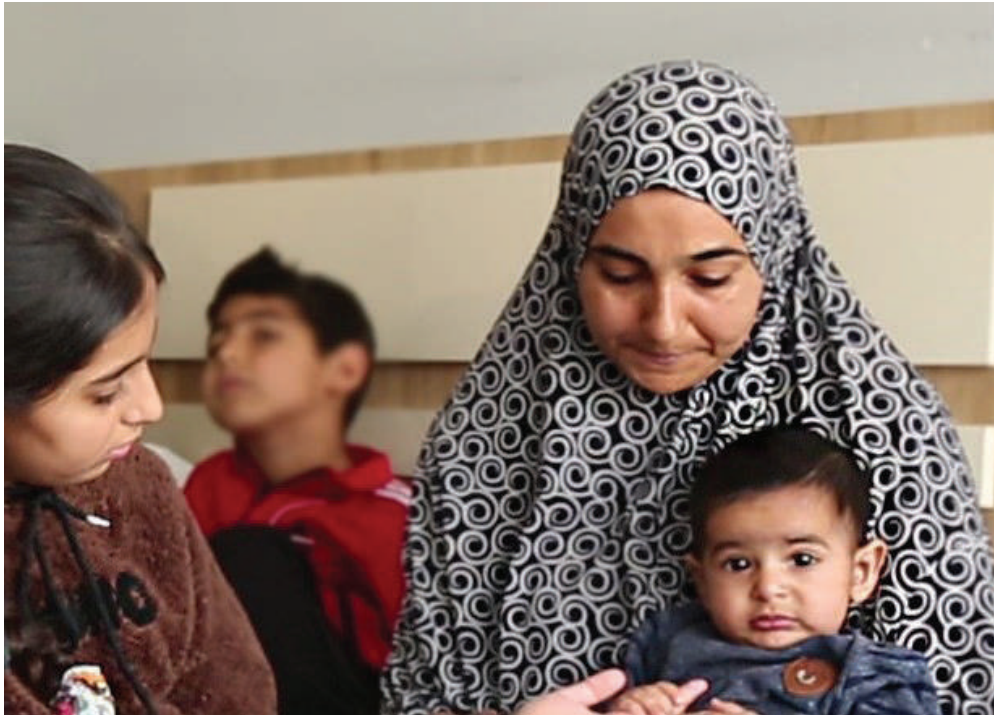
Türkiye, 2023. Refugee family who lost everything as a result of the earthquake currently in shelter provided by UNHCR.