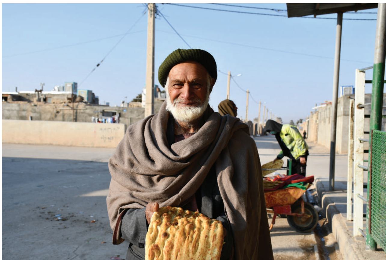
Iran, January 2023. An elderly Afghan man bought a fresh bread in Semnan refugee settlement, Semnan, Iran. Thousands of Afghan refugees live in Semnan refugee settlement, 220 Kilometres east of the capital, Tehran.

During 2022, UNHCR also concluded a data sharing agreement with Norway and made progress towards advancing similar agreements with other States. Existing protocols already implemented with the United States of America (USA) were further strengthened by training and technical support for biometric identity verification. In addition, a new tool in UNHCR's proGres database was deployed with technical guidance to collect and analyse data on the inclusion of LGBTQI+ refugees in resettlement programmes.