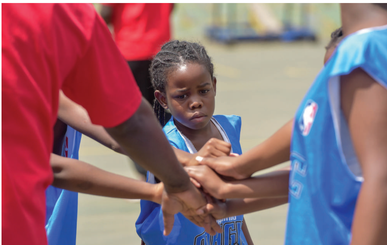
South Africa, November 2022. Young people of Sunnyside Basketball Club in Pretoria, including refugees and asylum seekers participate in a basketball tournament to raise awareness of gender-based violence.

The operation in DRC has determined that 13,693 refugees would need resettlement in 2024. The main profiles are for refugees from CAR with medical conditions, legal and physical protection challenges, survivors of violence and/or torture, and women and girls at risk, predominantly due to atrocities that occurred either prior to or during flight, especially for newly arrived refugees from CAR; South Sudanese refugees who fled the armed conflict in South Sudan, in particular certain ethnic groups (Dinka), GBV survivors, women at risk, unaccompanied or separated minors, and those with legal physical protection needs; and refugees from Burundi with legal and physical protection needs or serious medical needs.