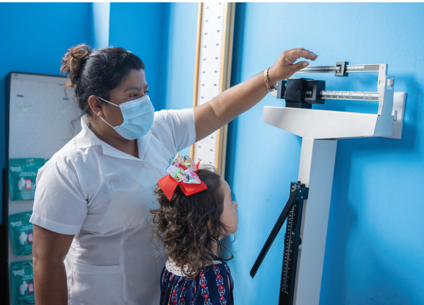
Guatemala, March 2023. A refugee girl is cared for by health personnel in new and improved facilities.

Despite the increase in resettlement quotas offered by States in 2022, these opportunities remained far below the 1.47 million refugees in need of resettlement. Evacuations of Afghan nationals and strained reception capacity in Europe responding to the Ukraine crisis impacted the expansion of third-country solutions, with existing structures and capacity being diverted to respond to these emergencies. Less than four per cent of refugees in need were able to access resettlement in 2022, with resettlement departures at 57,483 persons. This was significantly below the 90,000-target set by the Third Country Solutions for Refugees: Roadmap 2030 – although a welcome 46 per cent increase from 2021 (when departures were at 39,266 persons). The largest number of UNHCR-facilitated resettlement departures in 2022 were to the USA, Canada and Germany.