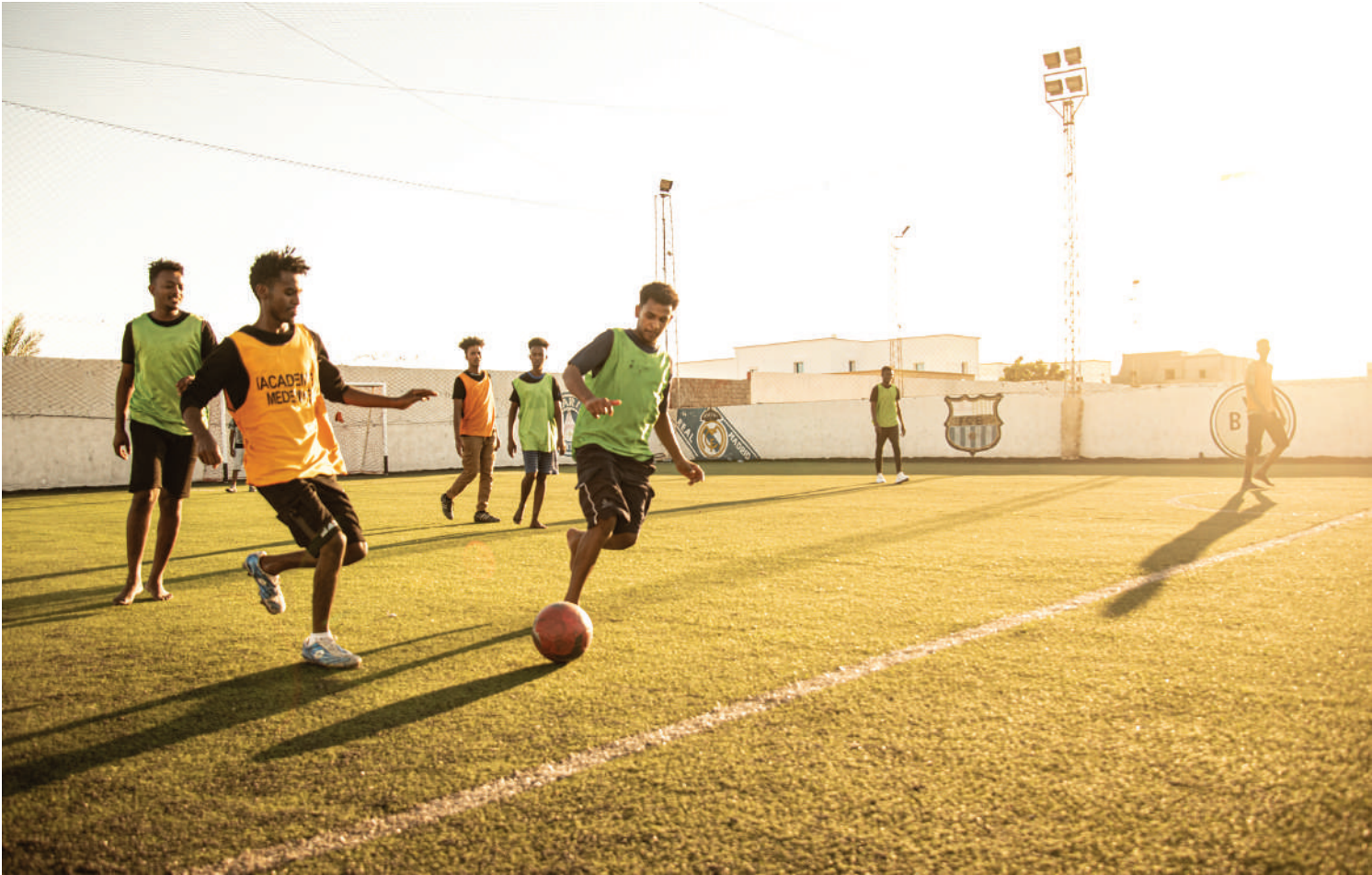
Tunisia, June 2022. Refugees and Asylum seekers living in the urban areas of Medenine governorate, Tunisia, came together for a moment of joy in the football Match organized by UNHCR and its partner the Tunisian Council for Refugees, as part of the World Refugee Day celebration.

or witnessed traumatizing incidents in their home country and have been further displaced in the country of asylum. As a result, for many vulnerable refugee families, there is little choice but to resort to harmful coping strategies such as incurring debt, skipping meals, early marriage or withdrawing children from school. Thus, the consequences of exile in Syria have elevated the protection risks and need for resettlement of female refugees and children.