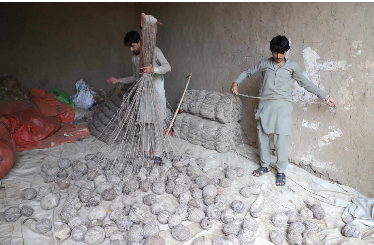
Pakistan, August 2022. Afghan refugees prepare yarn to be dyed and used in carpet-weaving, at the Kot Chandna refugee village near Mianwali in Punjab, Pakistan.

The unallocated quotas are an essential life-saving tool for UNHCR in Asia and enable UNHCR operations to respond to highly sensitive situations or to individuals facing particularly heightened or imminent risks.