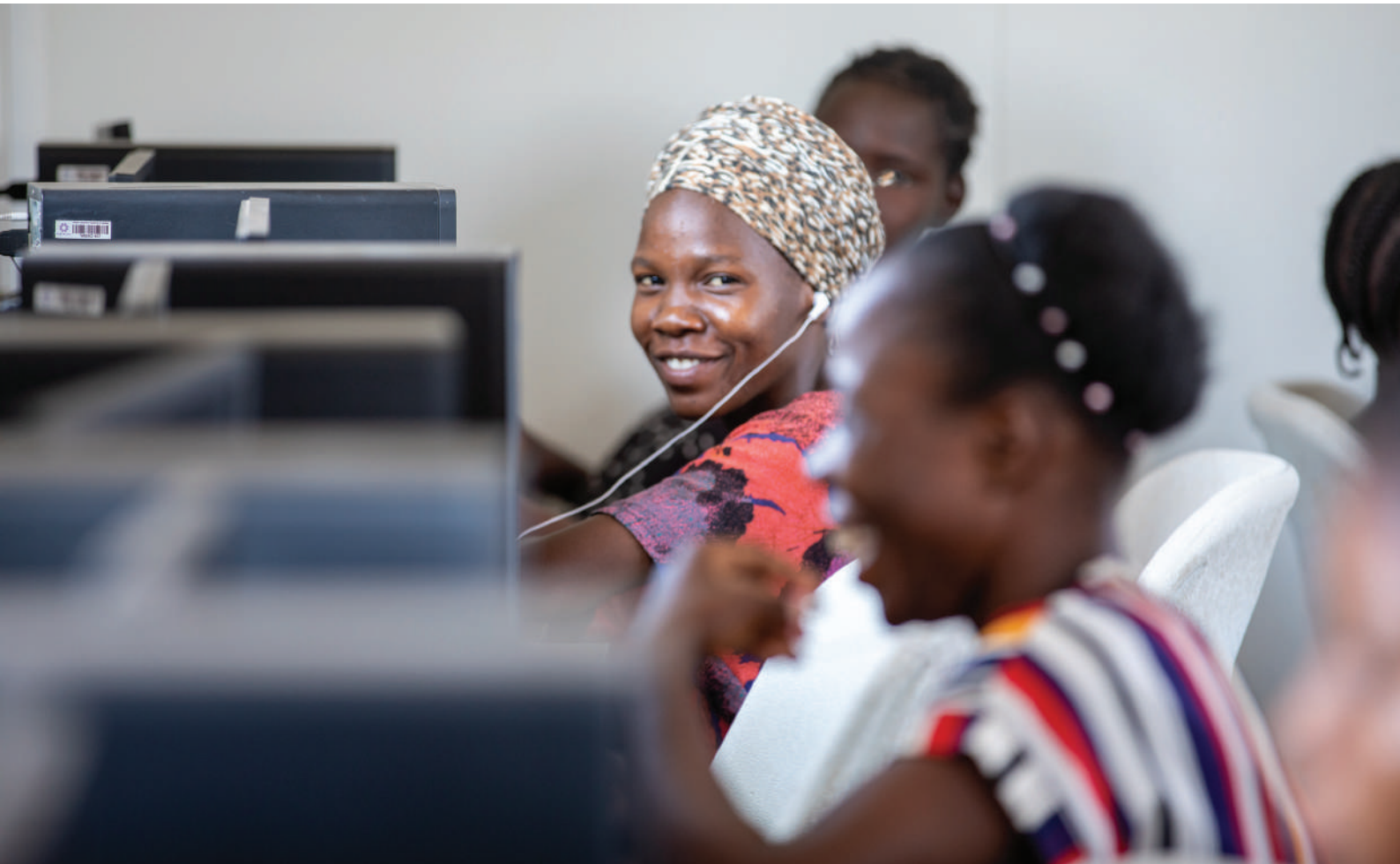
Kenya, February 2023. A student poses for a photo during an annotation digital learning class in Kakuma. Solidarity Initiative for Refugees is a local community-based organisation established in 2016 by a group of young refugees with the goal of using technology to equip refugees in Kakuma with the skills and tools to create a better future for themselves.

UNHCR Ethiopia projects that 192,831 refugees, mainly from Eritrea, South Sudan, Sudan and Somalia, will be in need of resettlement in 2024. This includes women and girls at heightened risk of gender-based violence (GBV), exploitation and abuse. In addition, survivors of violence or torture, such as many of the refugees in Amhara, Afar, Addis Ababa, Tigray and Benishangul-Gumuz, have resettlement needs associated with multiple displacement and witnessing or experiencing violence and serious violations of human rights in Ethiopia. Nearly 29,000 refugees are registered as unaccompanied or separated children (UASC) in Ethiopia. Children face multifaceted protection risks in Ethiopia, including child labour, harmful traditional practices such as female genital mutilation/cutting, early and