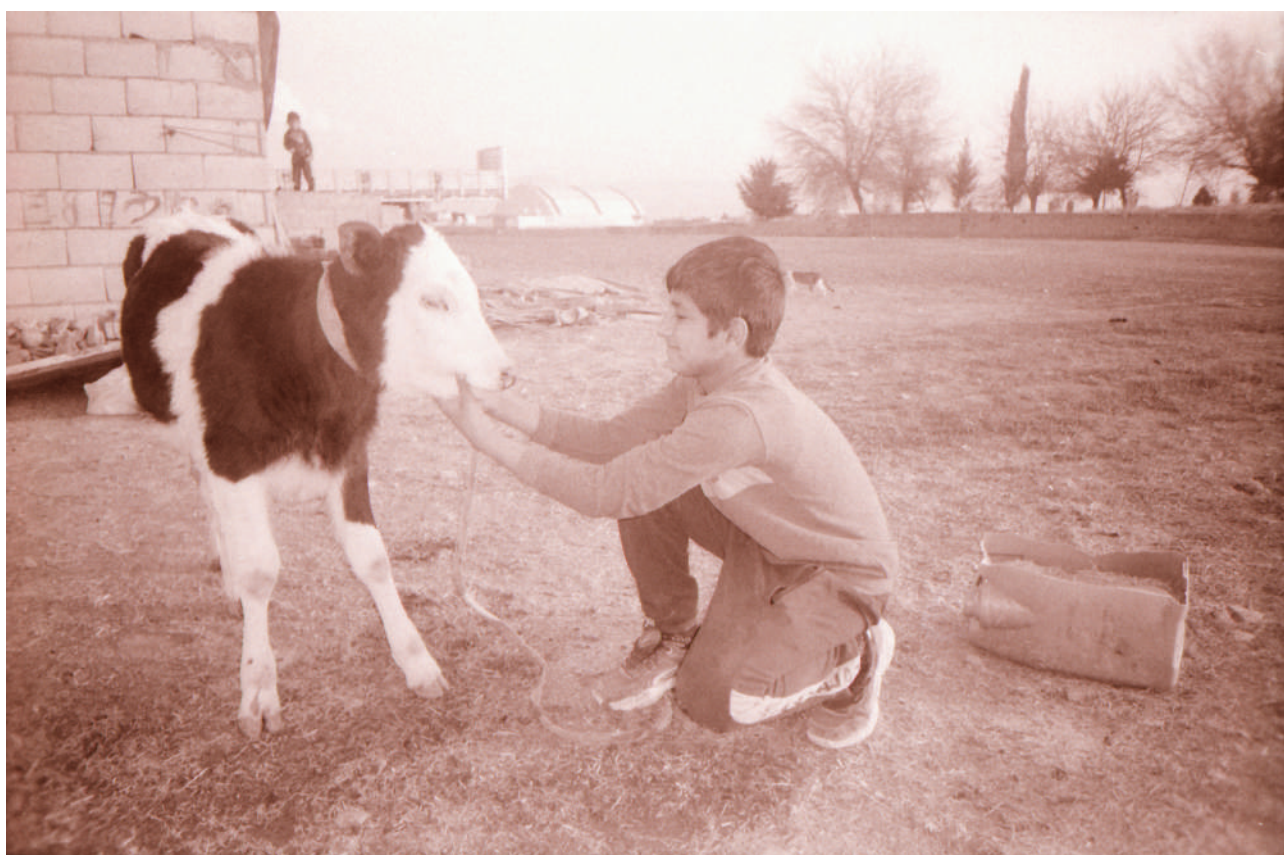
Türkiye, June 2022. UNHCR Türkiye had photography workshops with Turkish and refugee children in Mardin. Over 270 children participated in the workshops, which took 5 months in total. The photos taken by the children were exhibited at the World Refugee Day exhibition in Istanbul.

By end of 2022, European countries resettled 21,350 refugees in total, including 16,700 in 12 of the EU Member States. The continued impact of the pandemic on state adjudication and refugee departures, as well as a focus on the response to the Afghanistan situation with large number of evacuations to the EU have been some of the main challenges affecting resettlement arrivals in Europe in 2022. Furthermore, the conflict in Ukraine, which started in February 2022 and led to the arrival of a high number of refugees from Ukraine in the Europe region also partially explains the lower number of resettlement arrivals compared to the countries' commitments. The Ukraine crisis has had lasting effects on the reception capacity in Europe, as exemplified by the decision of a few European countries to suspend their resettlement programmes or slow down arrivals.