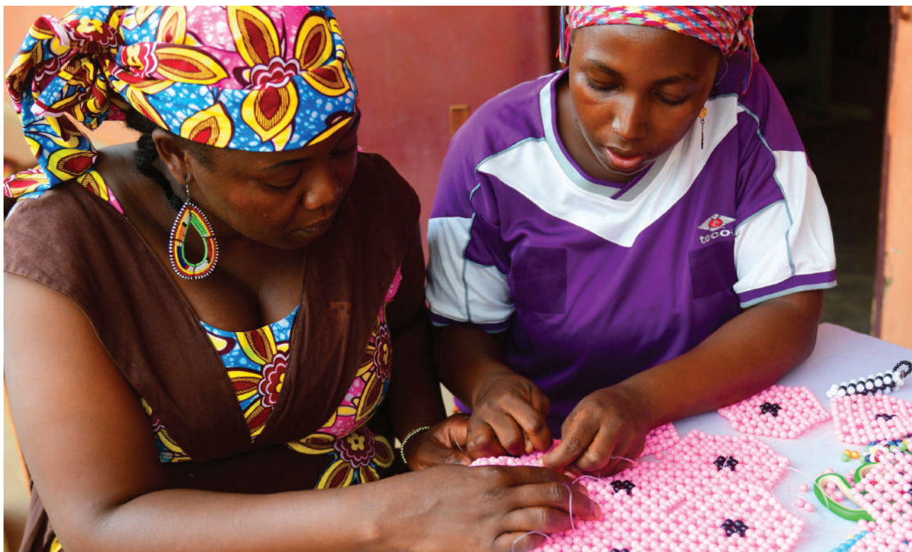
Cameroon, May 2022. A refugee from Central Africa Republic trains displaced women in craft-making.

CAR refugee situation, the ongoing instability in the country of origin, and the lack of tangible local integration prospects, resettlement remains a life-saving durable solution for this refugee population. Nigerian refugees in need of resettlement are almost exclusively those who have fled due to Boko Haram and have experienced violence or torture.