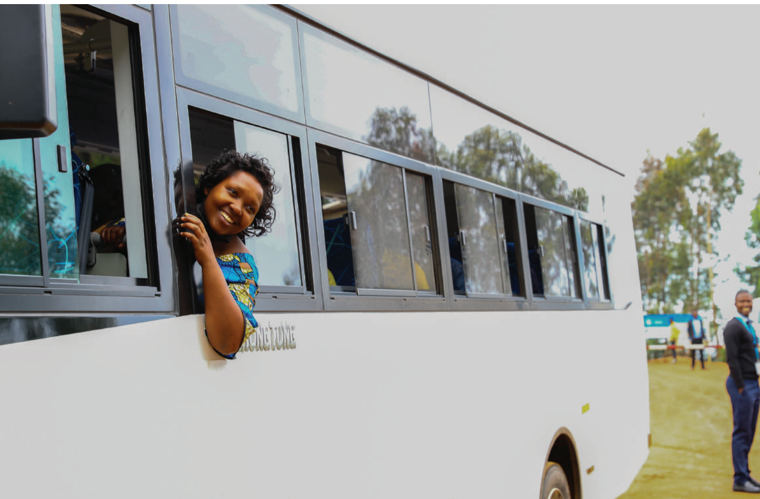
Rwanda, November 2022. Refugees from Kiziba camp prepare for resettlement to Norway.

account of insecurity as well as other factors (i.e. Djibouti, Somalia, South Sudan and Eritrea). Besides urgent and emergency protection needs, a considerable number of resettlement cases in EHAGL involve refugees with complex medical conditions in locations where the recommended treatment and health care services are inaccessible or unavailable.