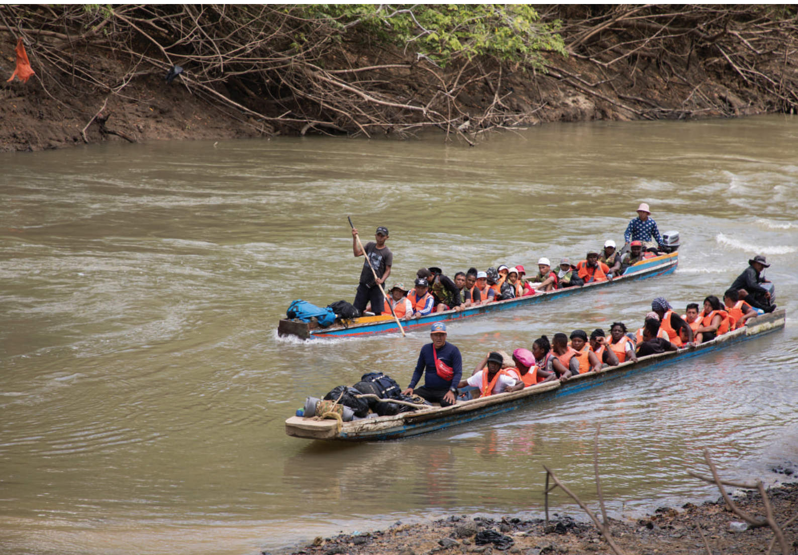
ma, February 2023. 24,634 people crossed the Darien Jungle in January 2023, risking their lives in the journey northwards in search of protection and safety.

In addition, 4.2 million Venezuelans have been granted residence permits and other types of regular stay arrangements. Countries such as Brazil, Colombia, Costa Rica, the Dominican Republic, Ecuador, Mexico, Paraguay, Peru and Uruguay have granted asylum and implemented legal stay arrangements, facilitating access to documentation and basic socioeconomic rights. Despite efforts towards protection and stabilization, limited access to registration, documentation, basic services and livelihoods opportunities, and rising xenophobia continue to affect increasing numbers of Venezuelans who remain at heightened risk.