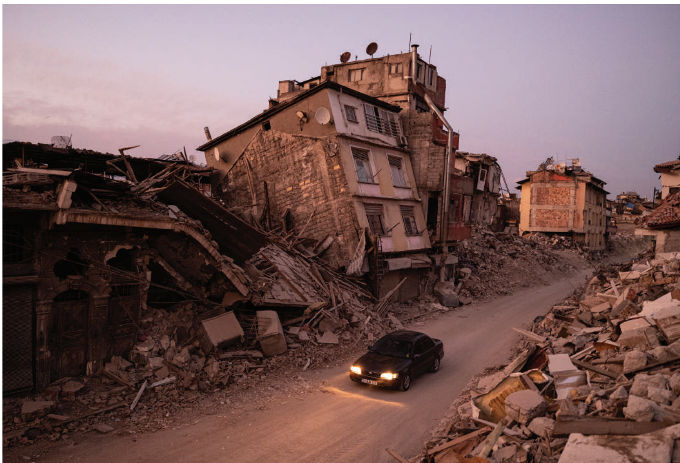
Türkiye, February 2023. Collapsed and damaged buildings in Antakya city, Hatay Province, Türkiye. Just two weeks after the devastating earthquakes that struck south-eastern Türkiye and northern Syria on 6 February, a further two powerful magnitude 6.4 and 5.8 earthquakes hit Hatay Province on 20 February, resulting in 6 deaths and some 300 people injured.

harmful coping mechanisms, such as child labour and child marriage. The situation was further exacerbated by the earthquakes that occurred in February 2023 which affected the lives of approximately 5.75 million people including 1.75 million refugees. The earthquakes caused massive damage and particularly impacted access to shelter, food and other basic services for all survivors. National and local capacities and infrastructure have been stretched to the limit, which, combined with socio-economic challenges, have led to changes in public opinion towards refugees and instances of social tensions.