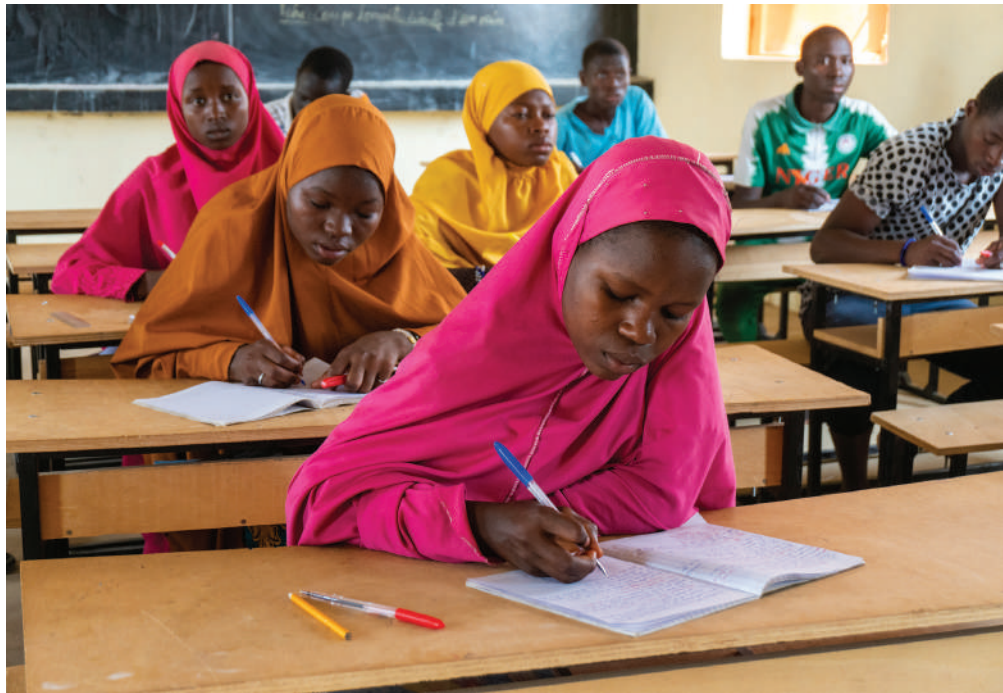
Niger, May 2023. Nigerian refugees and host community children benefit of education in Madaoua.

As with the Sahel situation, the conflict-driven nature of the displacement has given rise to a high prevalence of survivors of GBV and other forms of violence. ‘Survivors of Violence or Torture’ and ‘Women and Girls at Risk’ are the two most frequent resettlement submission categories in this context. In both Cameroon and Chad, resettlement remains central to the country operation protection strategies.