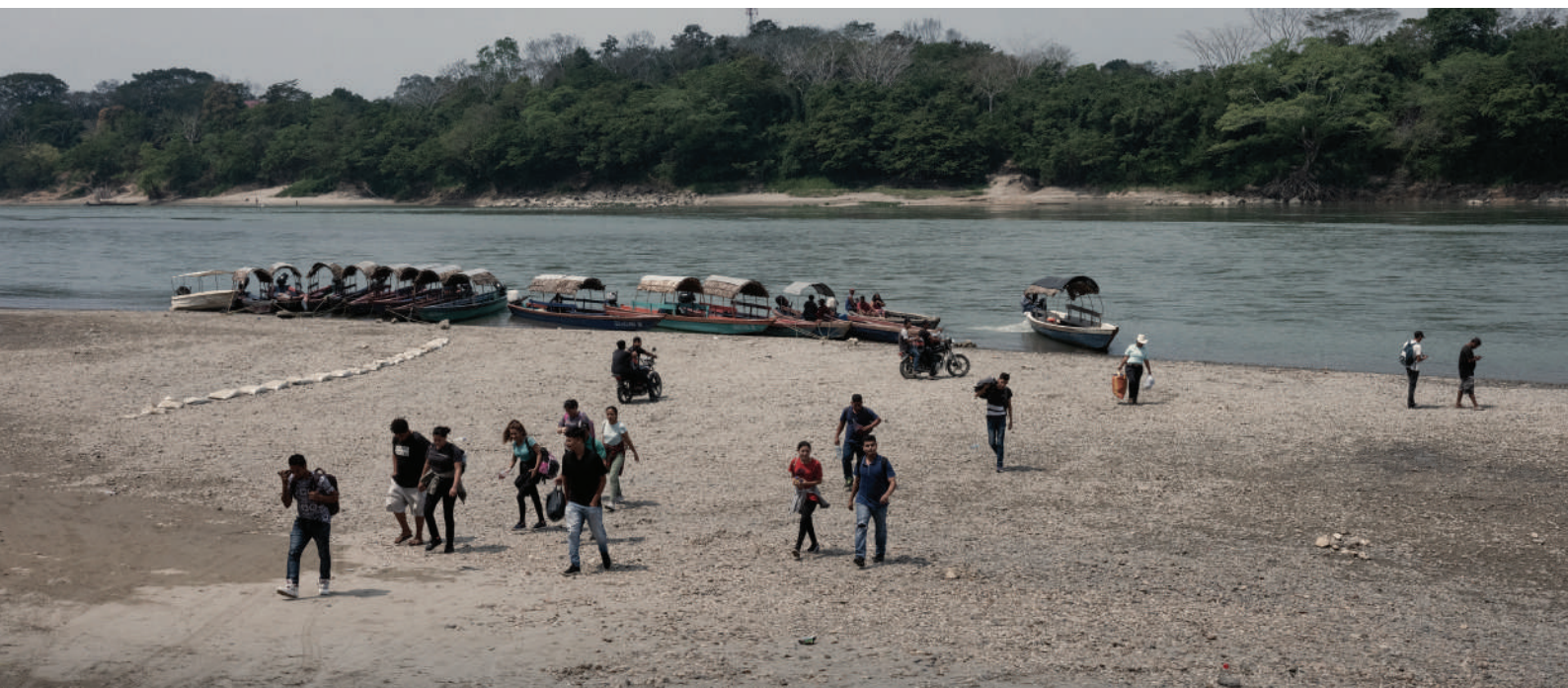
Mexico, March 2023. Asylum-seekers from different nationalities enter Mexico from Guatemala after crossing the Usumacinta River at Frontera Corozal.

By mid-2022, over 267,000 Nicaraguans had been forced to flee, with almost 89 per cent seeking protection in Central America, mainly in Costa Rica. In the first half of 2022, the number of Nicaraguan asylum-seekers increased globally from 164,000 to 224,000, and the number of Nicaraguan refugees