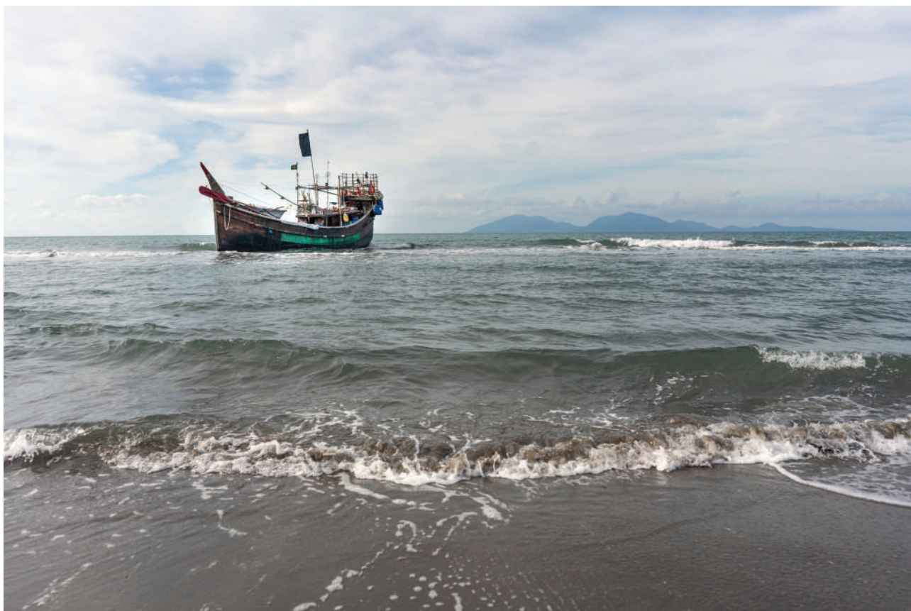
Indonesia, January 2023. A boat that carried Rohingya refugees across the Andaman Sea remains anchored offshore after the refugees disembarked at a beach in Aceh, Indonesia on 8 January, 2023.

a vulnerable position and limit their access to rights and services, including access to legal remedies, civil administration, certified education, gainful employment or social protection.