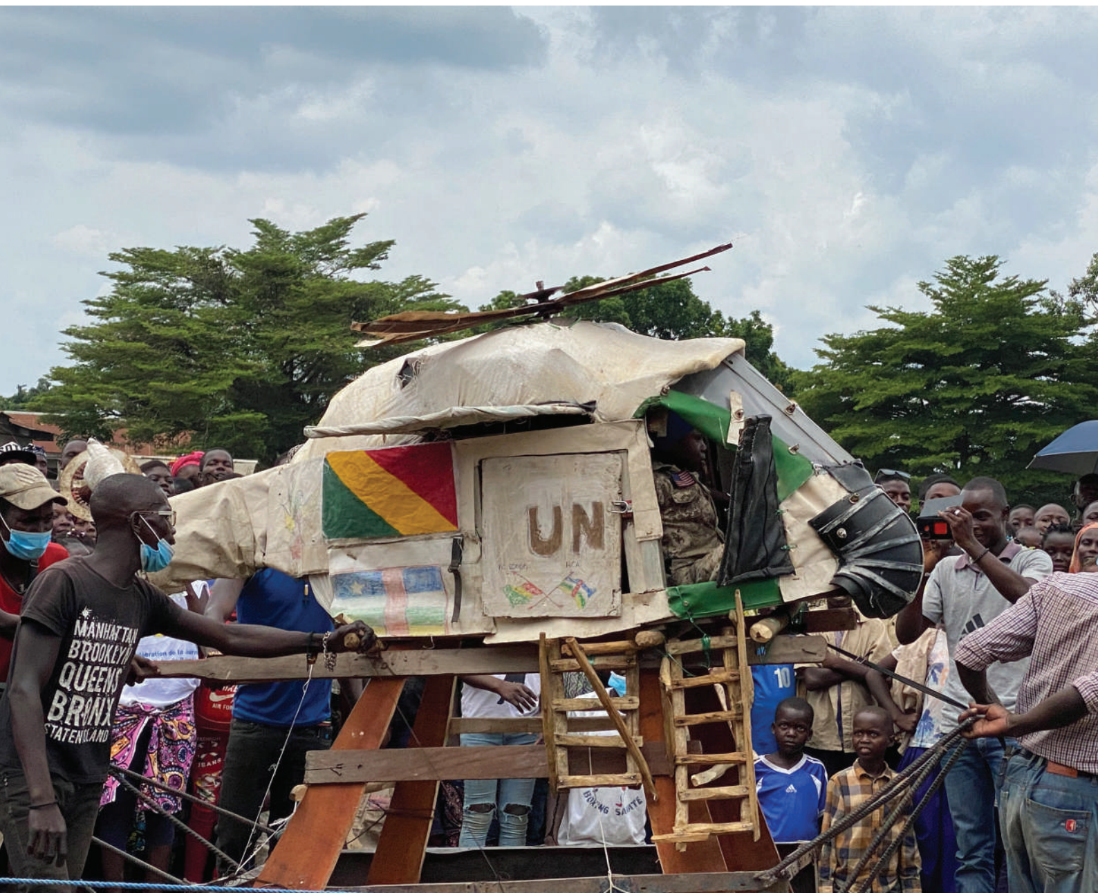
Republic of Congo, June 2022. Refugees and host communities celebrate peaceful coexistence on World Refugee Day.

of UNHCR's initiative to strengthen protection and solutions in the reality of increasing onward and mixed movement of people requiring comprehensive route-based responses.