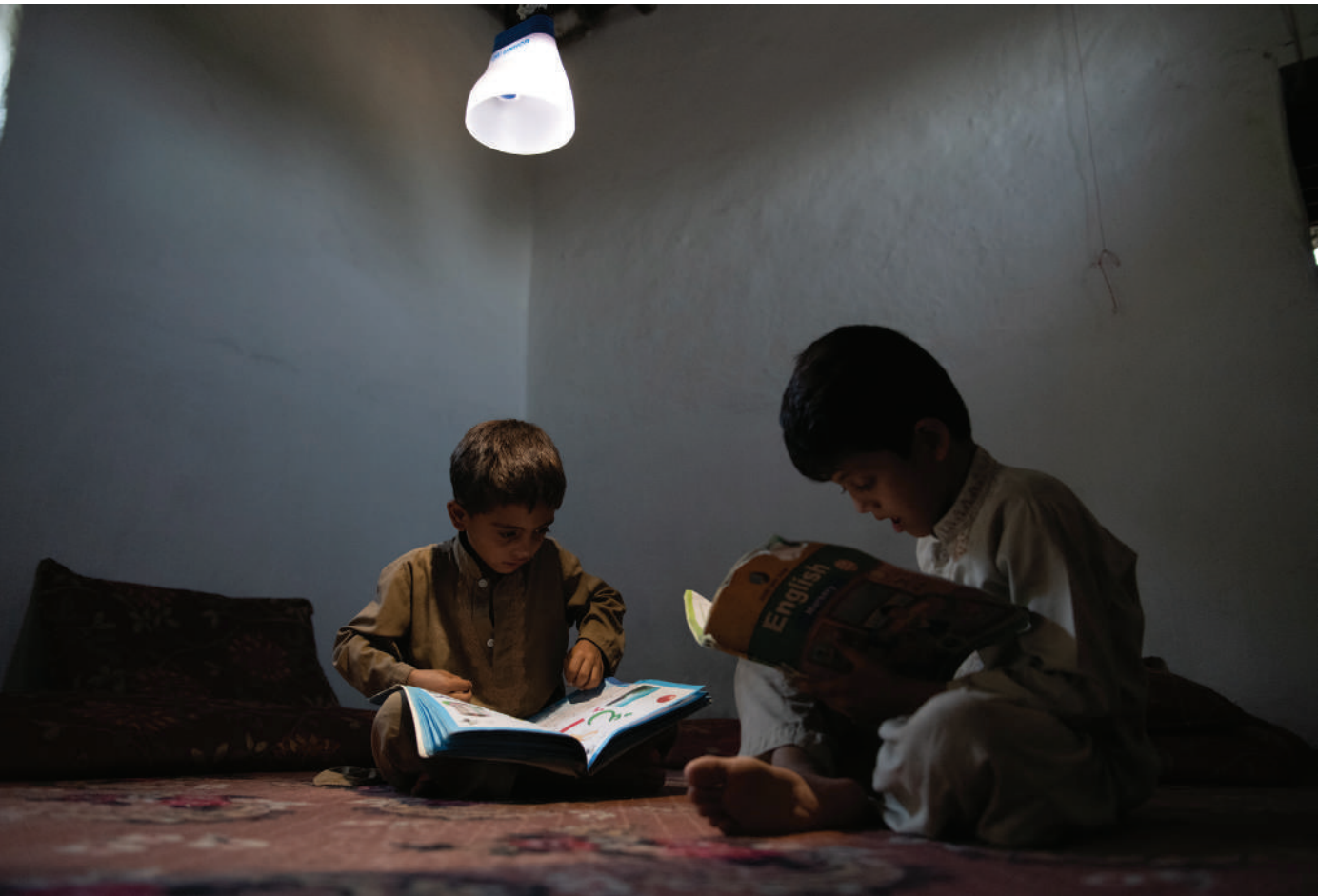
Pakistan, August 2022. Afghan Refugee family benefiting from Energy Efficient Cooking Stoves and Solar lanterns for Short-Term Energy Solution under UNHCR's Global Strategy for Sustainable Energy in Khazaana refugee village, Khyber Pakhrunkhwa.

The expansion of resettlement opportunities for Afghans hosted across the region, but particularly in Iran and Pakistan, will continue to open avenues for advocacy and engagement on broader protection issues between host governments, UNHCR and resettlement States.