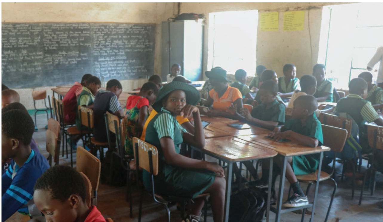
Zimbabwe, March 2023. Tongogara Primary School, at Tongogara Refugee Camp, is implementing together with UNHCR a Profuturo connected education project. The aim is to expand connected education programmes and reach more than 6,000 students from grades Primary 1 to Primary 7.

In Zimbabwe , the operation's Strategy (MYMPPSS) focuses on livelihoods engagements to enhance self-reliance and to support increased access to durable solutions. However, resettlement remains the only viable durable solution implemented for refugees in Zimbabwe. In Zambia , the operation's MYMPPSS recognizes the need for responsibility-sharing in providing durable solutions to refugees and other displaced persons. Malawi's MYMPPSS places an emphasis on a comprehensive approach to durable solutions, including a focus on resettlement. SAMCO's MYMPPSS prioritizes the pursuit of strategic durable solutions and complementary pathways. In the DRC , the operation envisages the further strengthening of resettlement and complementary pathways as part of its durable solutions strategy, alongside voluntary repatriation and its efforts to support integration and livelihoods.