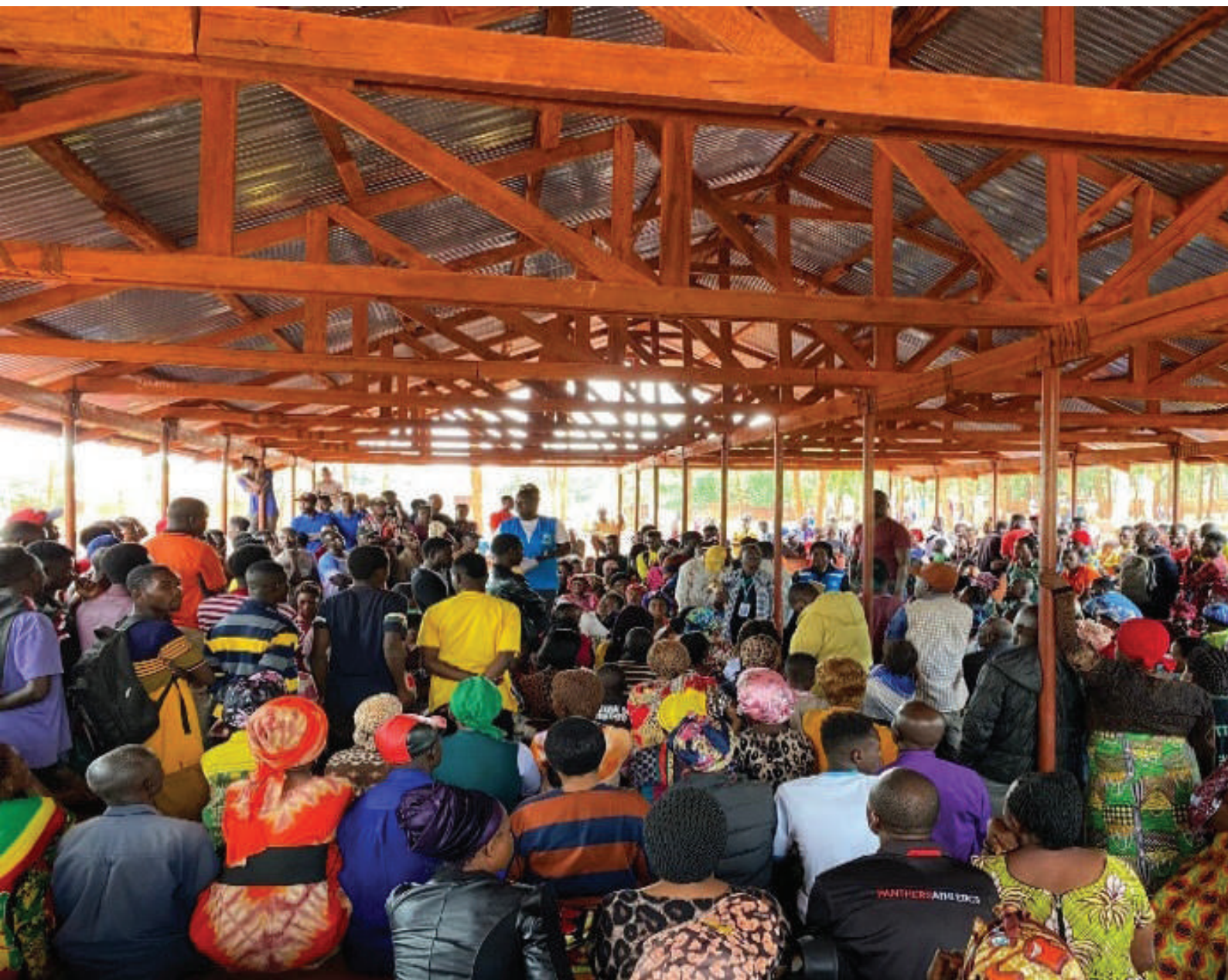
Tanzania. January 2023. Refugees in the Nyarugusu Refugee Camp received decision letters from the USA on 13 January 2023.