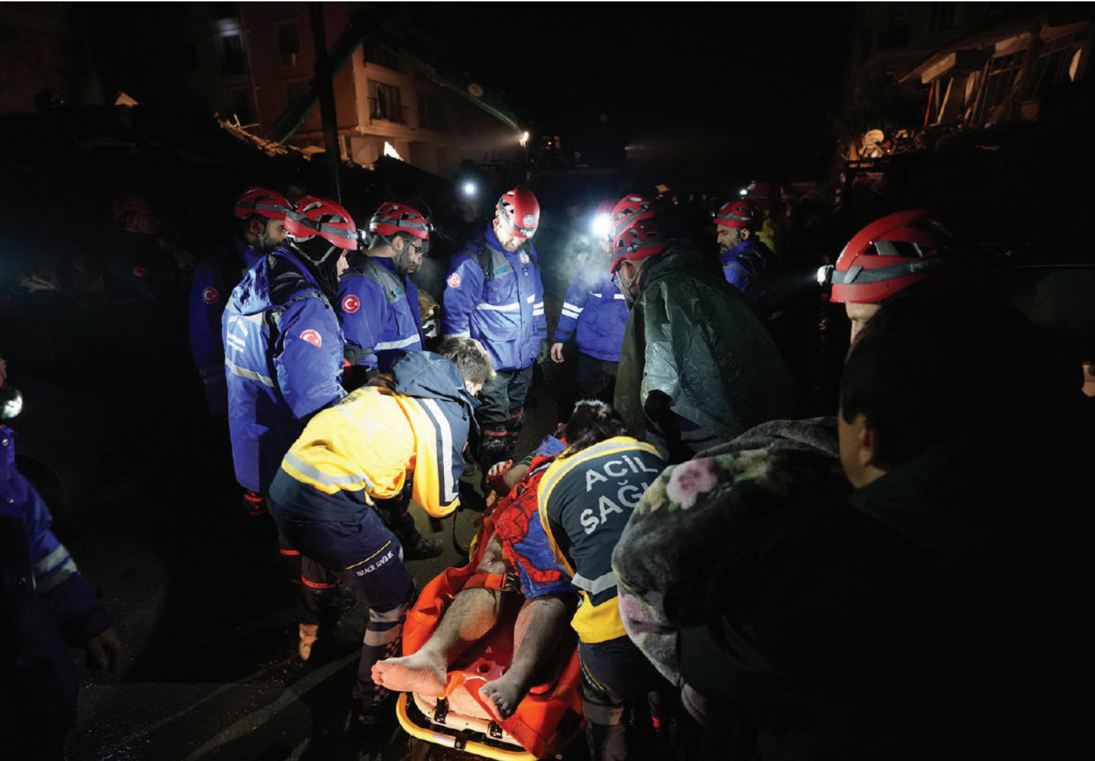
Türkiye, February 2023. Search and rescue teams from UNHCR partner SGDD-ASAM (Association for Solidarity with Asylum Seekers and Migrants) under the coordination of AFAD (Türkiye's Disaster and Emergency Management Authority) help survivors in Hatay Province, Türkiye, following the devastating earthquakes which struck the region on 6 February.