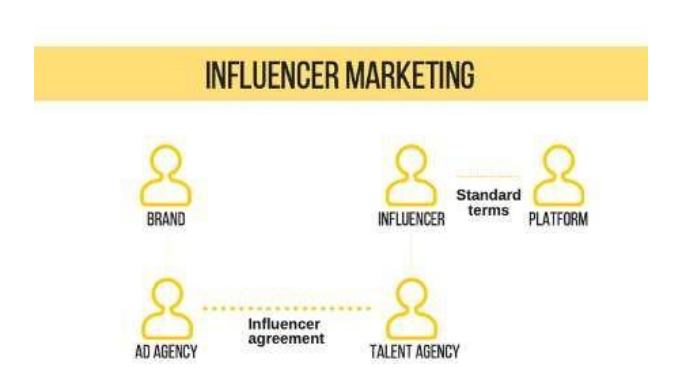
Figure 1 - Goanta & Wildhaber, 2020

sensu, namely to indicate those social media users who engage in influencer marketing as a business model (see Figure 1 below).