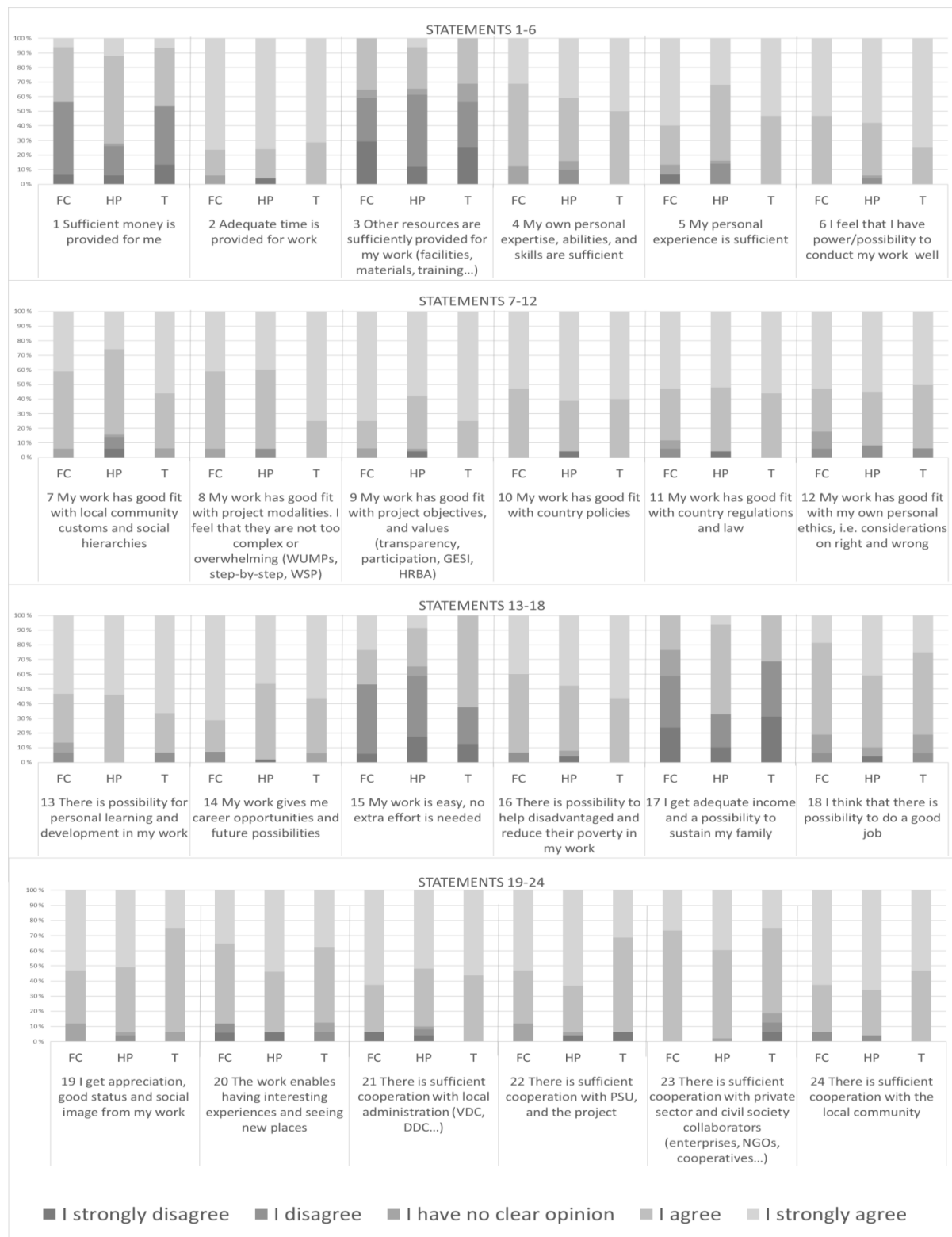
Figure A. Results of questionnaire responses by SPs (FC = Field Coordinator; HP = Health Promoter; T = Technical staff, engineering).